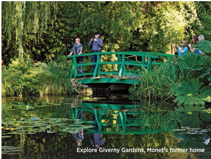
Explore Giverny Gardens, Monet's former home

Experience first-hand the Normandy beaches where the Allied vessels landed, as well as the memorials and museum, which honor the bravery of those involved and their ultimate sacrifice. Your Star-Ship remains docked in Honfleur overnight. Meals: B, L, D