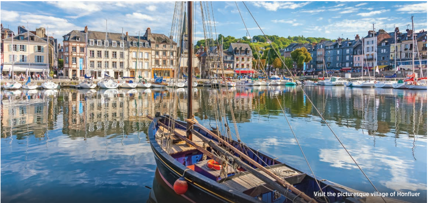
Visit the picturesque village of Honfleur